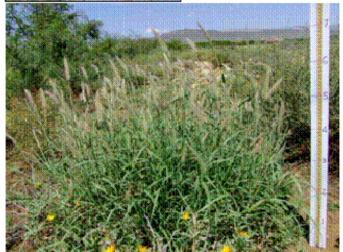
Scale: 1 decimeter