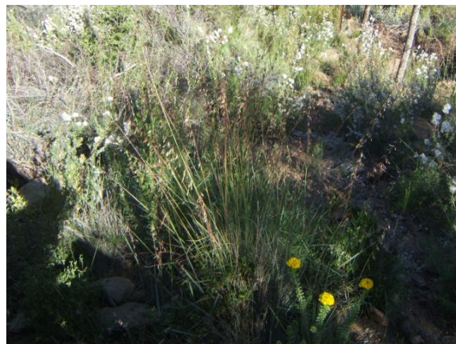
The photo above shows Ehrharta calycina in renosterveld near Ladismith

When and how to plant: Germinates only in cool wet weather. Sow autumn though winter (May-August) Roughen soil with a spade or implement. Mix seed with equal quantity of chaff or sawdust. To obtain even coverage, measure area to be sown into quarter hectare blocks (100 m x 25 m or 50 m x 50 m) and sow 1.5 kg of seed (3 kg of seed-chaff mix) onto each quarter hectare. Roll or trample the sown area to press the seed firmly onto the soil or rake the sown area with a rake or thorn branch. Cover the whole of the sown area with thorn branches to protect seedlings from livestock or game or fence game and livestock out.