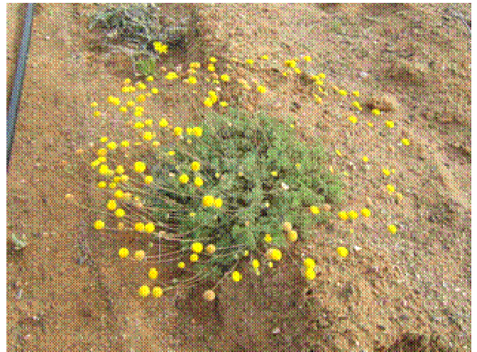
Growth habit – a winter-growing herbaceous plant. Strongly aromatic. Dies in October after flowering

Common name: Stinkkruid Family: Asteraceae Habitat: Disturbed soil such as old lands and roadsides. Plant description: mat-forming, winter-growing annual. Palatability: (★) very low Other uses: pioneer on bare ground Seed description: small (<2 mm) Viable seeds per kg: 8,380,000 When to plant: autumn