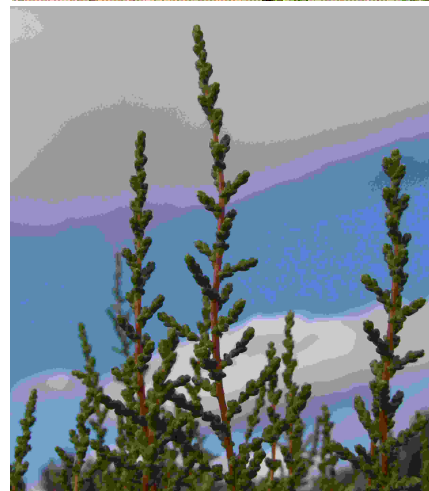
Characteristic red stems