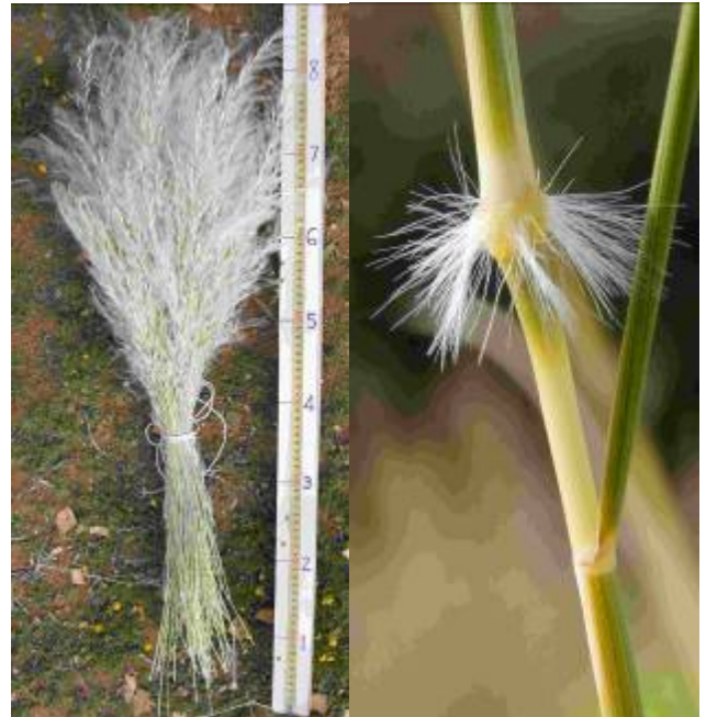
Left: Stipagrostis ciliata sold for reseedling. Right: Hairy node.

Dormancy: Fresh seeds do not germinate They need to ripen (age) for 6 to 12 months, and also require substantial rains or soaking for a minimum of three days to leach our chemical inhibitors. Expect germination only after substantial rains.