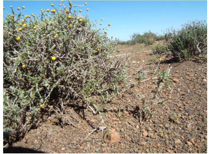
Mature plant with an anchoring branch

Soil preference: silty to clay soil, not sand. Salt tolerant, frost tolerant, but needs rainfall over 200 mm/year