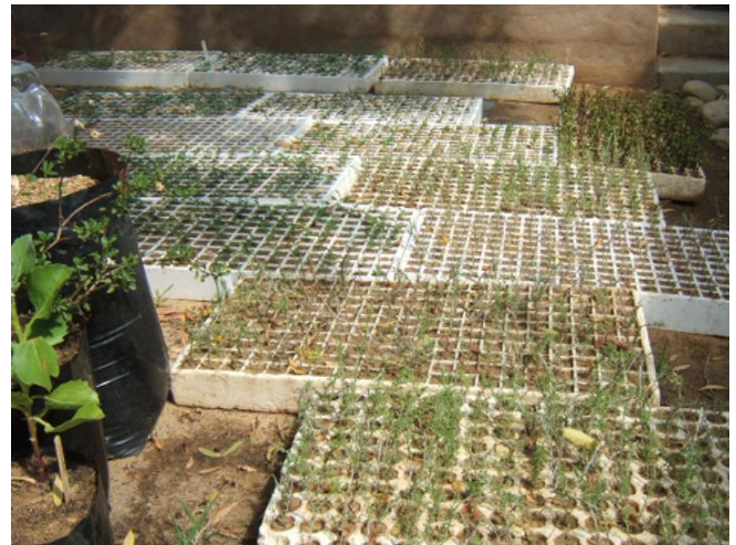
Plugs ready for planting into veld