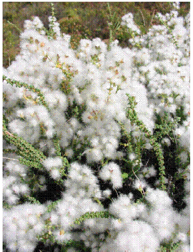
Fluffy “kapok” on seeding plant