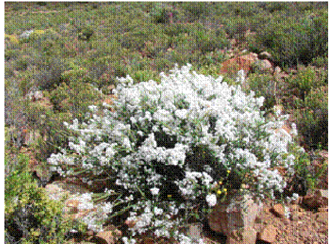
Plant in habitat

When and how to plant: Sow autumn, winter and spring into hollows or disturbed (ripped) soil, preferably mulched with stones.